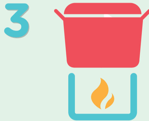
We heat the food to cook and pasteurise it.