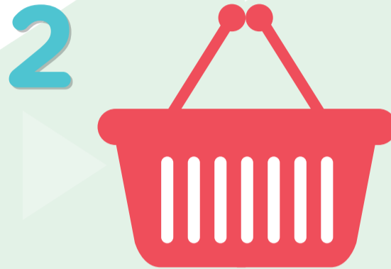
We collect the food that we want to eat.