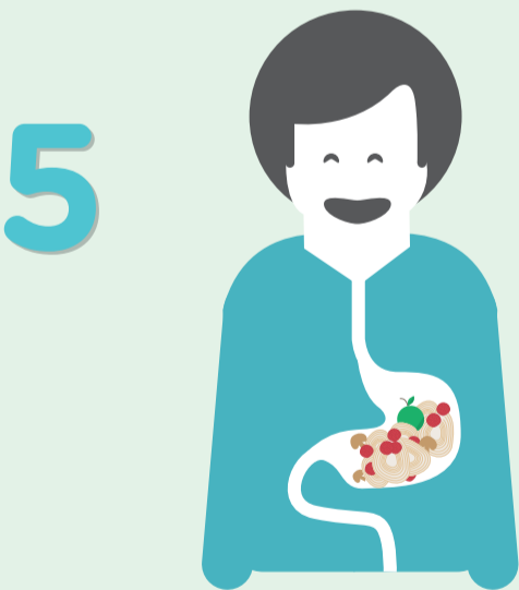
When we eat the food our stomach breaks it down and digests it.