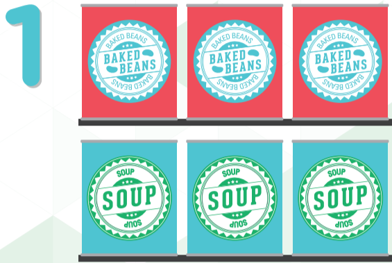
Food is stored in the supermarket.

You might not realise it but every day we all turn food into gases, waste and liquid - just like the Anaerobic Digestion process. Here's how: