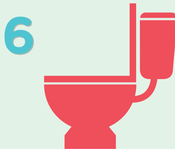
Over time we release this digested food waste through gas and by going to the toilet.